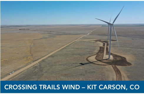
CROSSING TRAILS WIND – KIT CARSON, CO