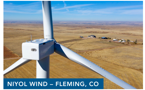
NIYOL WIND – FLEMING, CO