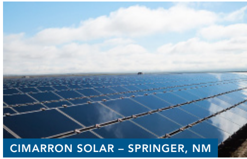
CIMARRON SOLAR – SPRINGER, NM